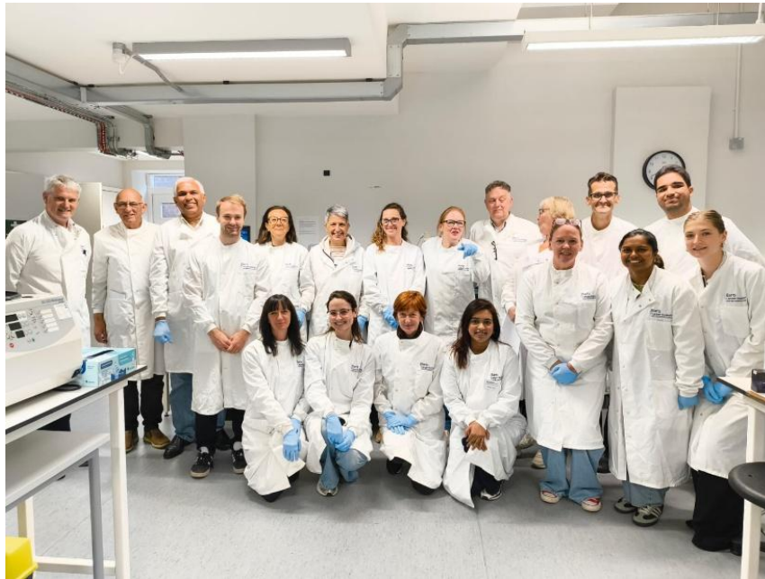
VOICE 2025 Graduates and Lab Team